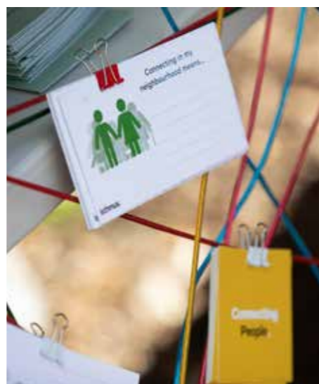
Weave created by Ōwairaka residents who visited the Isthmus stall at the Ōwairaka Information Day

HLC is now inviting the community to sign up to a series of discussions and workshops, and join the conversation about the greenway project. If you'd like to be involved, get in touch by emailing us at info@owairakadevelopment.co.nz .